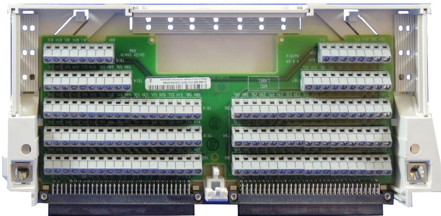
Figure 3. E1466A Terminal Block