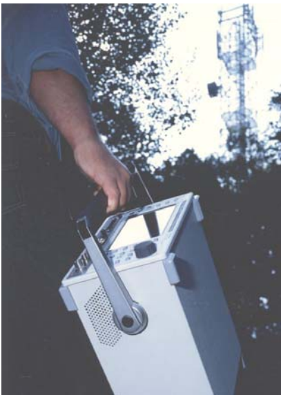
6113 Digital Radio Test Set can easily be carried to remote sites

A programmable synchronization output allows external equipment such as a spectrum analyzer or a logic analyzer to be triggered at any point in the GSM frame. Using this trigger signal, spurious signals can be monitored either out-of-band or during the unused slots.