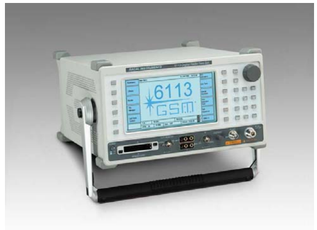
6113 Digital Radio Test Set

PASS/FAIL criteria. The test is then run with a full set of results returned including the PASS/FAIL indication.