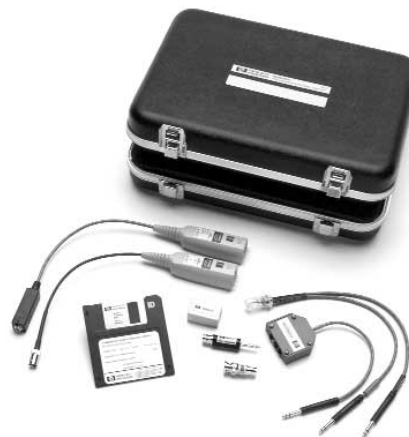
E2625A Communications Mask Test Kit provides a 1.44MB floppy with the mask templates as well as a number of hardware connectors and adapters.

Once you've chosen the appropriate mask, simply click on the Align button to automatically perform a fast, exhaustive search for the optimum fit of the mask to the test signal (some communication standards do not allow for any margin adjustment; thus, the align function is not available in all cases). This virtually eliminates the need for manual adjustments to your oscilloscope. This is an especially valuable feature for production test applications.