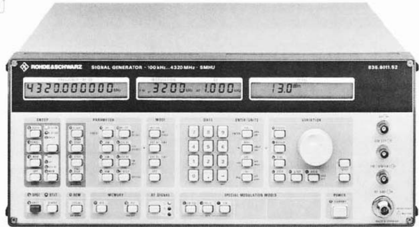
SMHU (photo 37927)

High-performance generators with excellent features over a wide frequency range