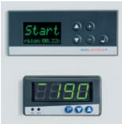
MINCONTROL terminal and independent adjustable temperature limiter