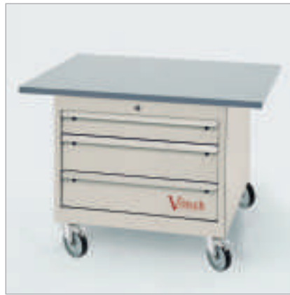
Laboratory table, mobile with drawers (option)