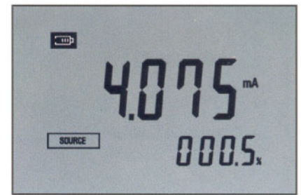
mA SOURCE DISPLAY