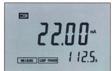
LOOP POWER DISPLAY