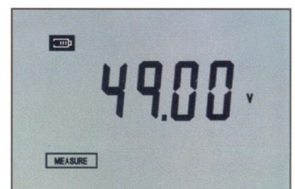
Voltage MEASURE DISPLAY

WENS Precision Co., Ltd. ISO 9001 Certified.